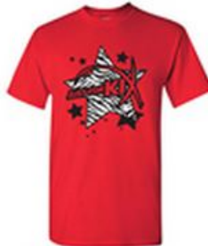
JFK Red Zebra Star Tee Item#: T0097 $12.00

Dates: 8/20/18 - 5/20/19 Facility: Just For Kix Dance Studio Instructors: Cassie Course #: MK15208