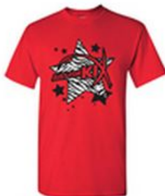
JFK Red Zebra Star Tee Item#: T0097 $12.00

Dates: 8/21/17 - 5/14/18 Facility: Just For Kix Dance Studio Instructors: Cassie Course #: MK11038