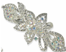
RHINESTONE CLIP H0310 $8.00