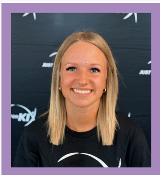
GRACIE head instructor