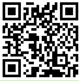
Dance With Me