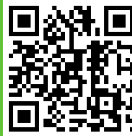
Wee Petite Tue