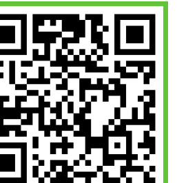
Middle Hip Hop