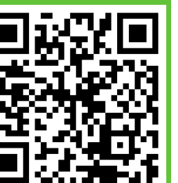
Wee Hip Hop