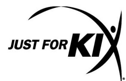
Photo Release: If you do not want your child's photograph and/or image published, or use for Just For Kix advertising please initial here. _____