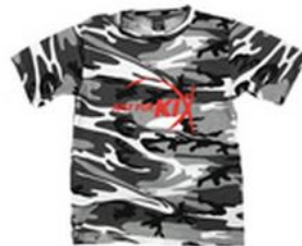
JFK Camo Hip Hop Tee Gray - 100% Cotton Item#: T0087 $16.00

Dates: 9/11/17 - 12/04/17 Facility: Just For Kix Studio Instructors: Crystal Hoepner Course #: MK11119