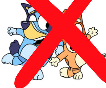
BLUEY THEMED CAMP