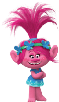
TROLLS THEMED CAMP