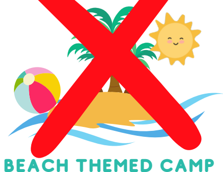
BEACH THEMED CAMP