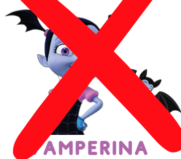
AMPERINA THEMED CAMP