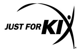
Photo Release: If you do not want your child's photograph and/or image published, or use for Just For Kix advertising please initial here. _____