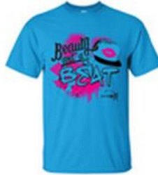
JFK Beauty & The Beat Item#: T0085 $12.00