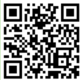
Dance With Me