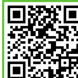
Mini Hip Hop