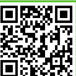
Wee Petite Mon 5:15