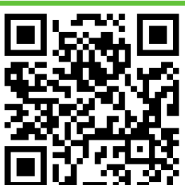
Tiny Kix Thu