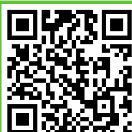
Wee Petite Mon 6:30