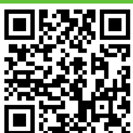
Wee Hip Hop