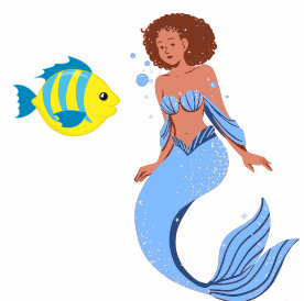
LITTLE MERMAID THEMED CAMP