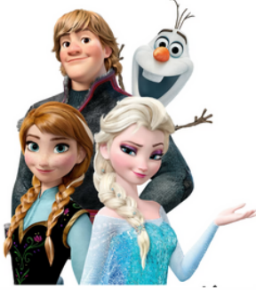
FROZEN THEMED CAMP