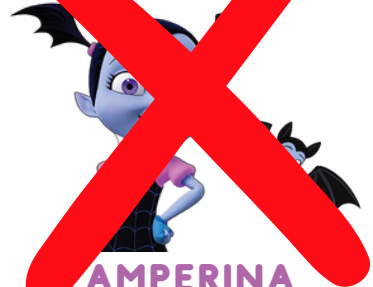
AMPERINA THEMED CAMP