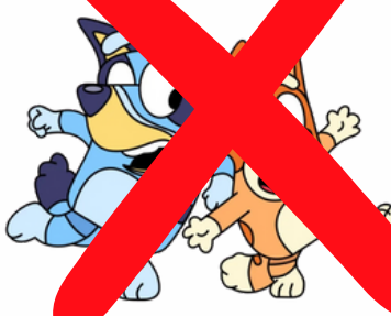
BLUEY THEMED CAMP