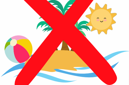
BEACH THEMED CAMP