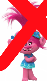
TROLLS THEMED CAMP