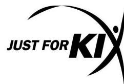
Photo Release: If you do not want your child's photograph and/or image published, or use for Just For Kix advertising please initial here. ____