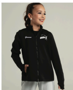
WARM UP JACKET