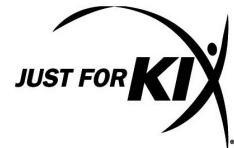
Photo Release: If you do not want your child's photograph and/or image published, or use for Just For Kix advertising please initial here. _____