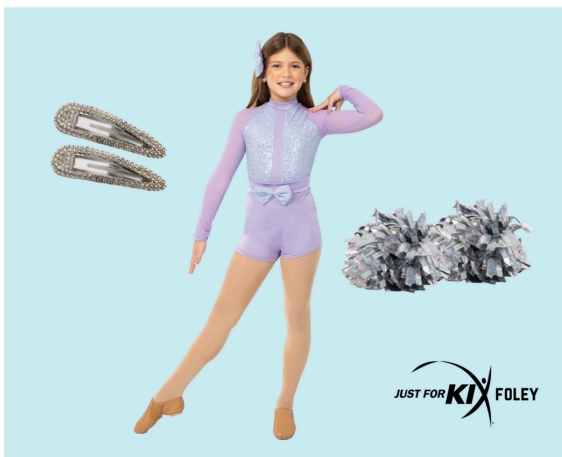
Wee Pom: Grades 2&3