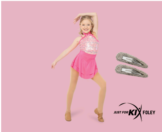
Wee Combo: Grades 2&3