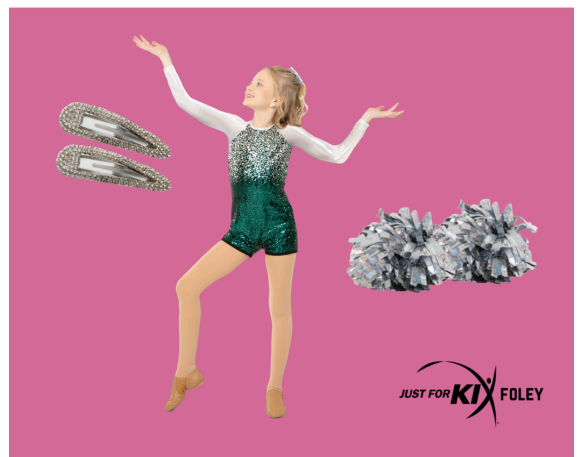
Mini Pom: Grades 4-6