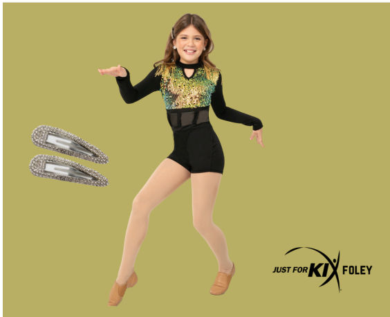
Wee/Mini Kix: Grades 2-6