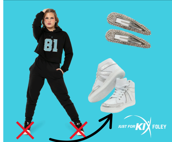
Wee Hip Hop: 2nd & 3rd