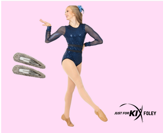
Junior Combo: Grades 7-12