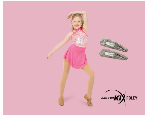
Wee Lyrical: Grades 2&3