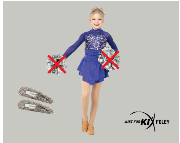
Mini Combo: Grades 4-6