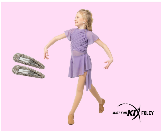
Mini Lyrical: Grades 4-7