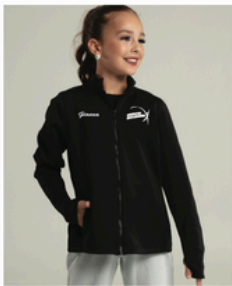
WARM UP JACKET JFK3002 $68.00 Youth: S-L Adult: XS-2XL