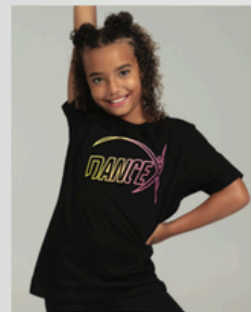
PROGRAM TEE JFK3000 $20.00 Youth: XS-L Adult: XS-3XL