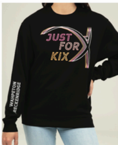
CREWNECK SWEATSHIRT JFK3001 $50.00 Youth: S-L Adult: S-3XL