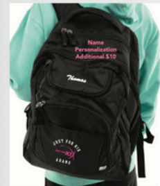
BACKPACK JFK3003 $50.00