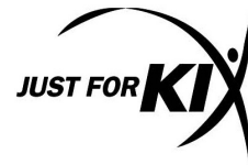
Photo Release: If you do not want your child's photograph and/or image published, or use for Just For Kix advertising please initial here. _____